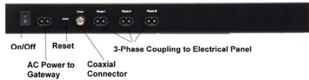
Figure 2 Back of Gateway