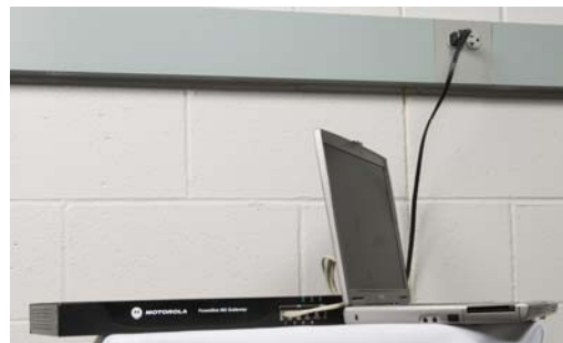
Figure 3 Test the Gateway