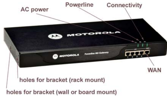
Figure 1 Front of Gateway

Using a CAT 5 straight-through Ethernet cable, connect the Internet source, such as a Canopy SM, to the WAN port on the front of the Gateway.